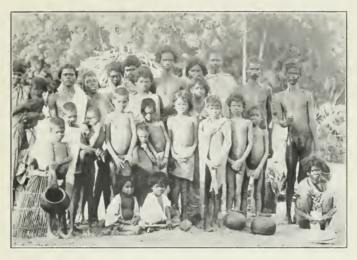
YANADIS The Negritic type is unequivocal in this group.