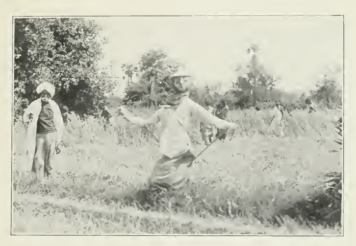
AN IMAGE TO AVERT THE EVIL EYE

This image is for the protection of the ripening grain. It appears to be a scarecrow, but it is not for the purpose of scaring birds. It is expected that this image will attract attention and so divert evil from the grain.