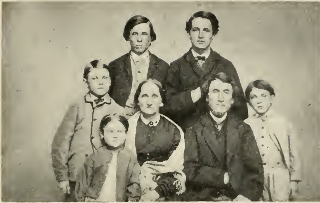
THE DUTTON FAMILY.