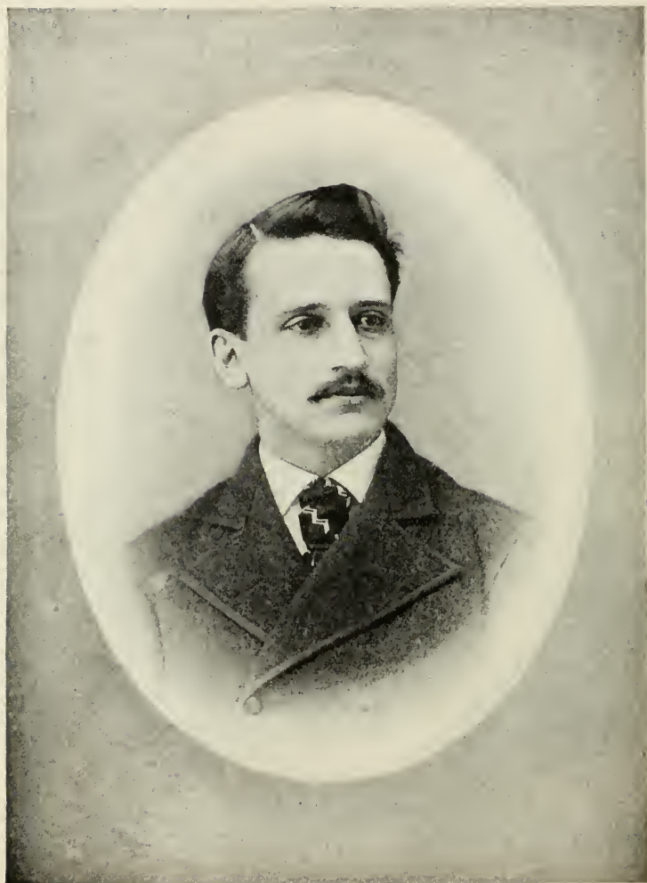
SAMUEL T. DUTTON IN 1873.