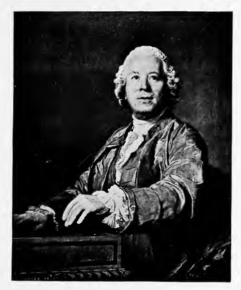
GLUCK After the painting by N. F. DUPLESSIS